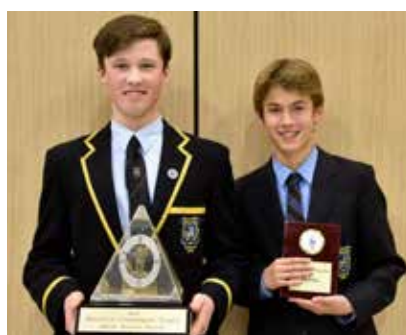
Winner of the St Marcellin Champagnat Trophy

We congratulate this year's overall winner, Marist College North Shore , and look forward to Marist Oratory at North Shore in 2019!