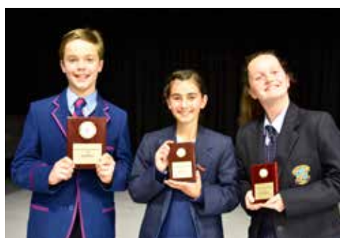
Year 7 Award recipients