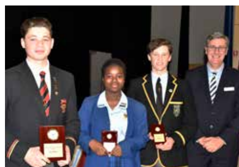
Year 11 Award recipients