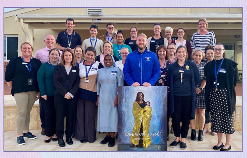
Above: St Joseph's School Northam gathered for the Known and Loved: Dignity for All Program

- Compendium of the Social Doctrine of the Church No. 132