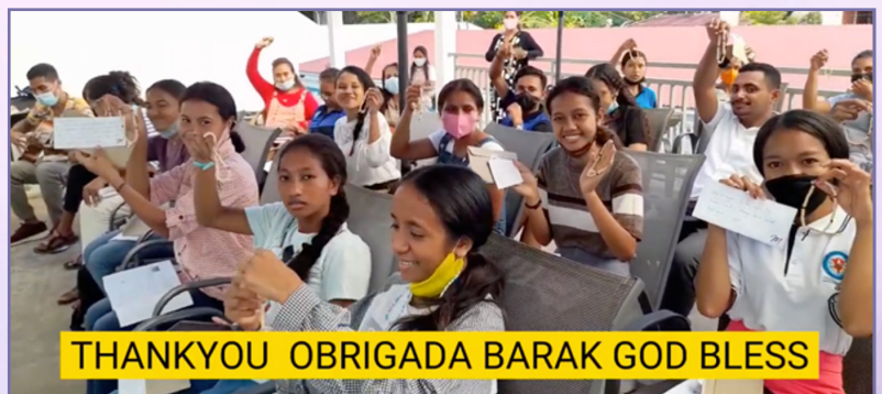
Above: Staff from Timor Leste receive their rosary beads

God is ridiculously and madly in love with us. He knows us and is pouring out his mercy upon us, but he needs us to accept it and pay it forward to others. This unfathomable love doesn't really make sense unless we can show Him that we, too, are capable of that kind of crazy love for our neighbours...those we know and those we are yet to meet. St Marcellin Champagnat wanted his early Brothers to be remembered for their love of one another and especially those young people who were the least and most neglected.