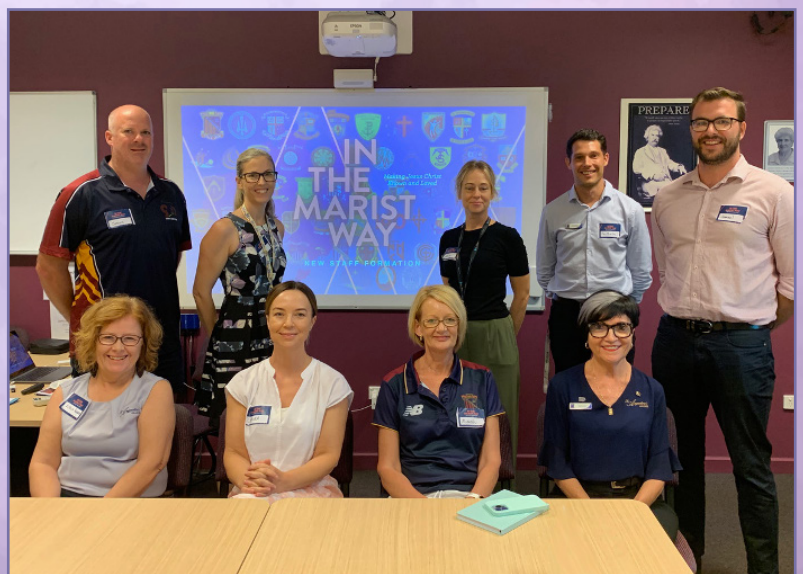
Above: Participants in the In the Marist Way: New Staff Formation program at St Augustine's College, Cairns

God is ridiculously and madly in love with us. He knows us and is pouring out his mercy upon us, but he needs us to accept it and pay it forward to others. This unfathomable love doesn't really make sense unless we can show Him that we, too, are capable of that kind of crazy love for our neighbours...those we know and those we are yet to meet. St Marcellin Champagnat wanted his early Brothers to be remembered for their love of one another and especially those young people who were the least and most neglected.