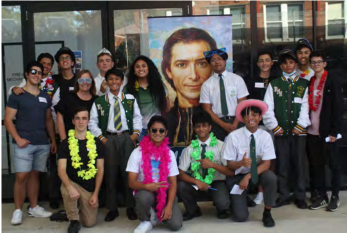
Parramatta Marist High School

One hundred students from 9 Marist schools took part in our first 'in person' Super Connect in 2 years! The joy of being 'physically' together was evident especially during the Ice breaker activities. Anti-slavery was focus of the gathering as it related perfectly to 2022 Marist theme, 'Known and Loved, Dignity for all' .