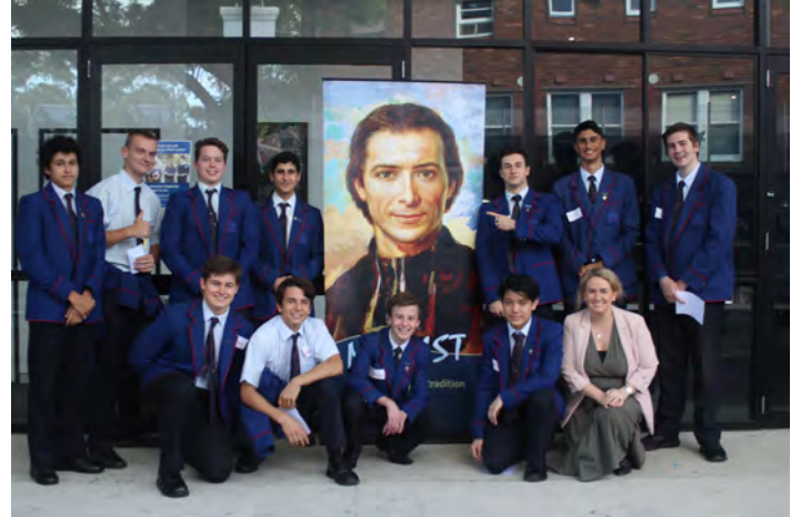
Marcellin College, Randwick