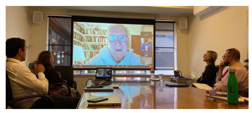
Melbourne Local Associaition Group gathering at Marcellin College Bulleen