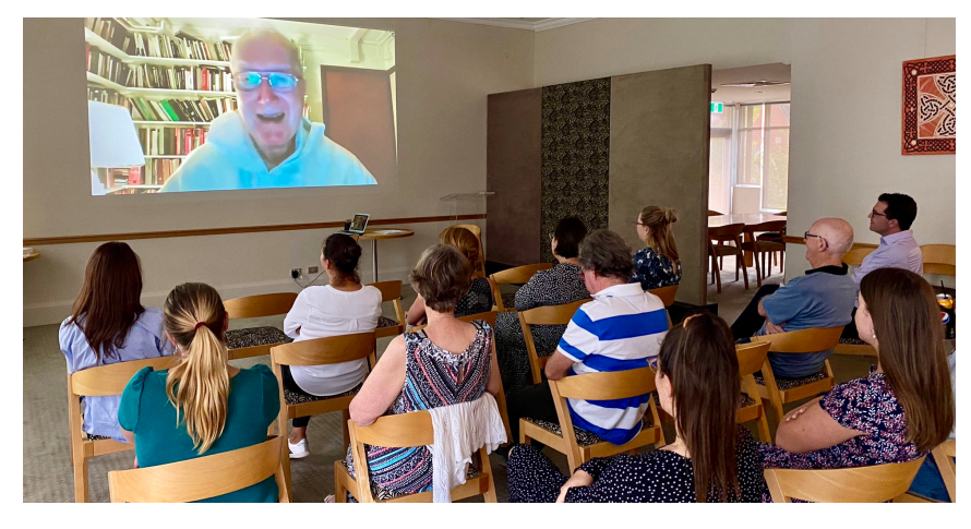
Perth Local Association Group gathering at Newman College