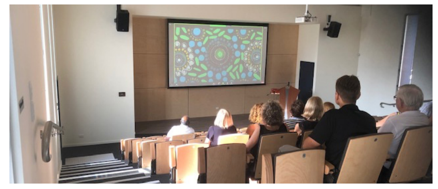
Sunshine Coast Local Association Group gathering at St Teresa's Catholic College Noosaville to view the symposium

A link to a video recording of the session can be found here.