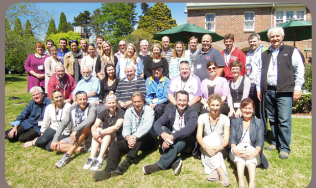
Final Footsteps 1 programme for 2013, Mittagong, 21-24 October.