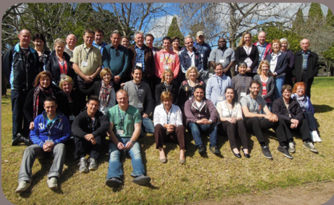
Participants and Team at the September Footsteps 1 programme

Seven have been conducted this year: five of Footsteps 1 and two of Footsteps 2. They have been wonderful experiences for both participants and Staff, and the evaluation comments attest to their worth and profound personal value for all. The MLF team has spent many hours updating and crafting these programmes; successfully delivering seven has been rewarding and satisfying and more energy will be invested in the Footsteps programmes for 2013 to ensure maximum participation and learning for all.