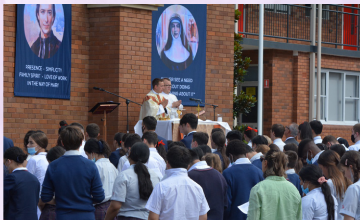
Above: Trinity Catholic College Auburn/Regent's Park