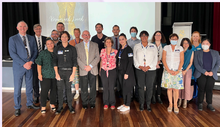
Above: St Patrick's Marist College Dundas – In the Marist Way, new staff induction program