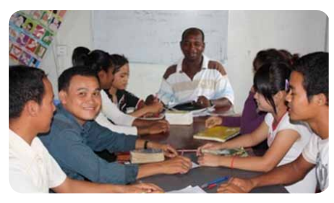
Photo caption: The Ad Gentes project has seen a Marist Brothers Community establish a similar education centre in Pailin, in northwest Cambodia

In partnership with the Marist Ad Gentes project throughout Asia, Australian Marist Solidarity is now helping to support forty young Burmese migrants (aged 15-25). They are living in Samut Sakhon, a coastal province in Thailand, and a program will be developed for them to acquire skills in basic computing and information technology. This will be combined with job referral assistance once these students complete their training modules at which time they will have the confidence to seek out paid-work opportunities.