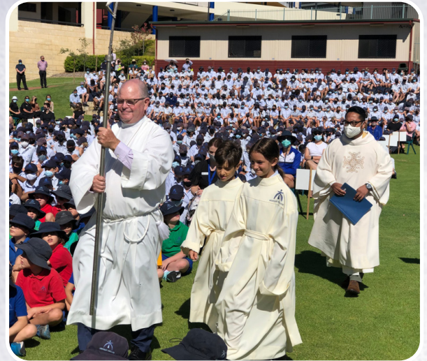
Above: Newman College in Perth - Opening Mass