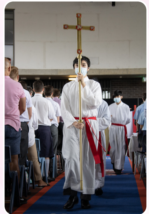
Top Left and Above: Marist College Kogarah - Opening Mass