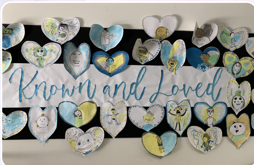
Above: Our 2022 theme beautifully realised by Years 3 and 4 students at St Patrick's Primary School, Kilmore