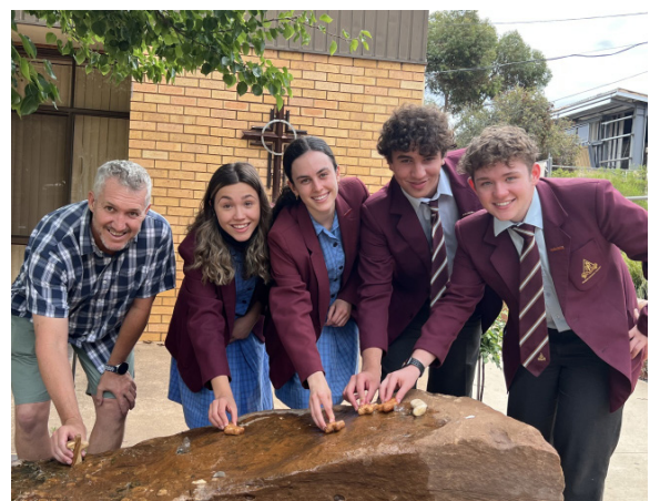
Marian Catholic College, Griffith

The MYM Sydney Team are excited to see what these leaders will achieve next year. Best wishes to all students and we hope to see you again!