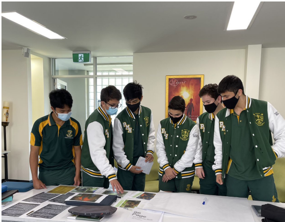
Parramatta Marist High School