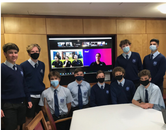
Marist College Canberra