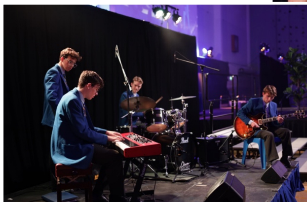
Above: Entertainment showcasing the talent of Marist music students