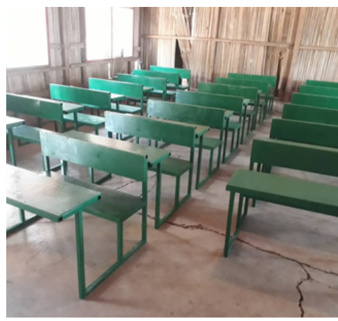
The new furniture