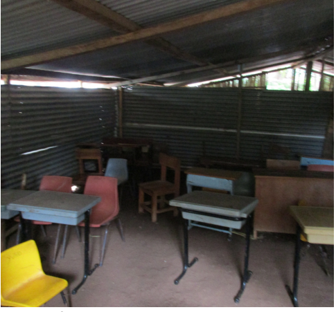
The old furniture needing replacement