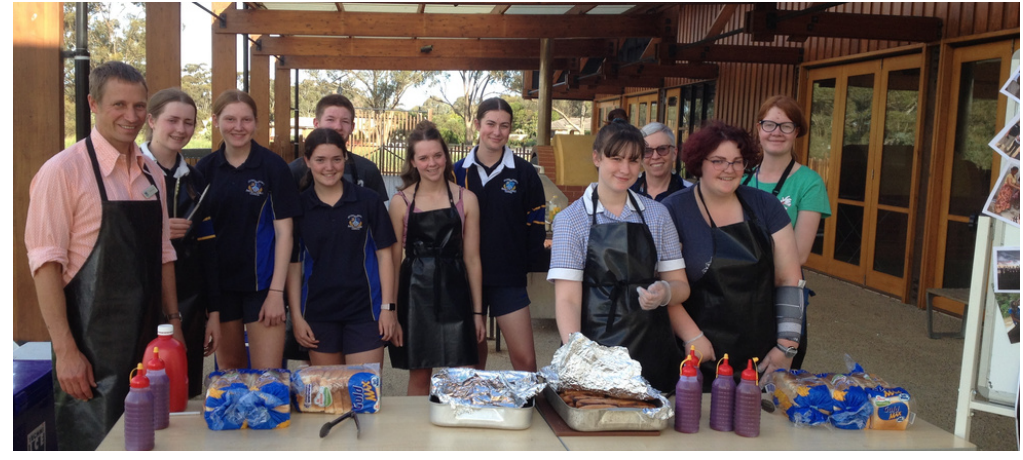
The teachers and students raising funds