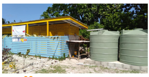
FACILITIES FOR THE FUTURE

Investing in infrastructure to ensure safe places for learning