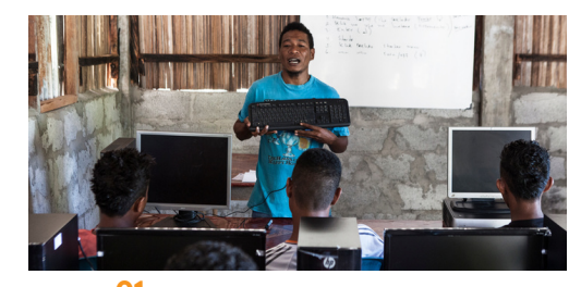
O1 ACCESS FOR ALL

The card will be sent to you, for you to write in and then give or send on to the recipient for Christmas.