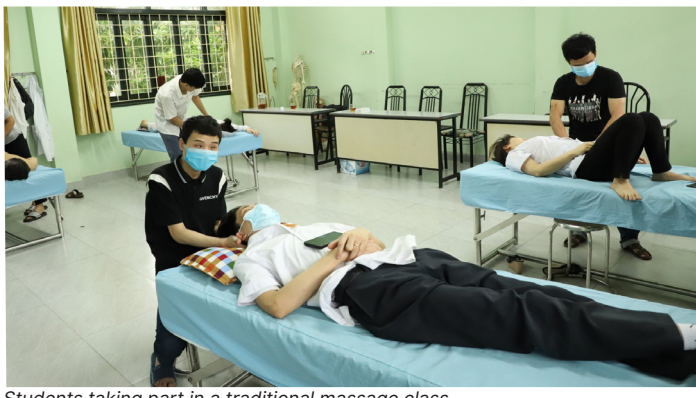
Students taking part in a traditional massage class.

We are nearing the end of the year, a reminder to send your donations into AMS before the school year ends!