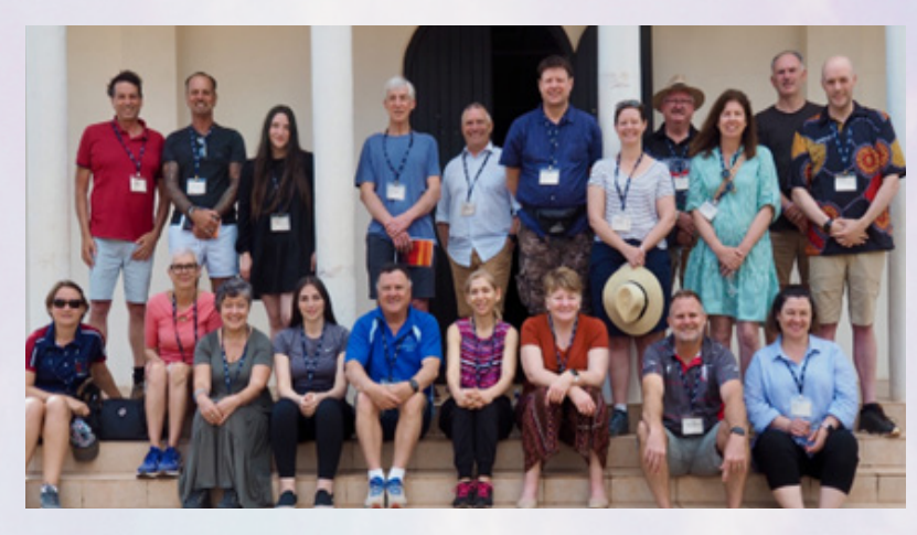
Solidarity Retreat Group Photo

This retreat enhanced my understanding and awareness of the rich history of the Marist Brothers in the Northern Territory and the mission of Ltyentye Apurte over several decades, where many Brothers have committed their lives to walk in solidarity with the local first nations people".