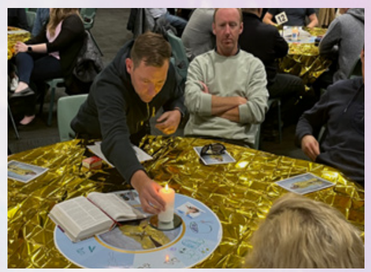
The liturgical setting of each table with a safety blanket and a variety of symbols relevant to their community in 2022.