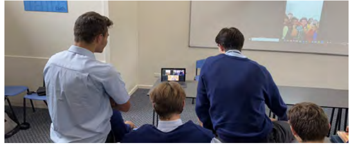
Students at Marist College Canberra joining an online get-together with boys from Chetana Tribal Boy's Hostel.

The Brothers recently identified further urgent community needs, and with AMS assistance, will provide a year's Family Food and Education Support to 100 families in the Santhal community. Basic food and essentials packages ('Parcels of Joy') reach 400 vulnerable children and parents.