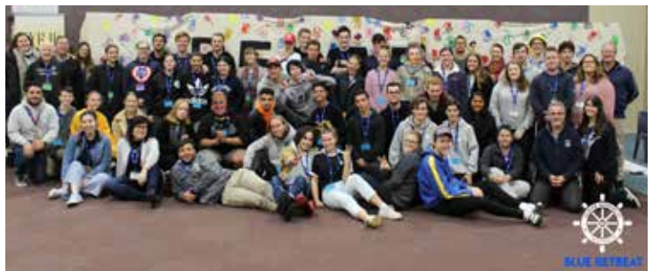
Blue Retreat at Forest Edge, with staff and students from Assumption College (Kilmore), Notre Dame College (Shepparton), Marymede Catholic College (South Morang), Marist College (Bendigo), Marcellin College (Bulleen)

After the mid-year break, the RMT will continue to facilitate camps and retreats around the country, with a two Year 10 Red Camps focusing on “Leadership” and two Year 12 Gold retreats, focusing on “Vocations” and other post school opportunities.