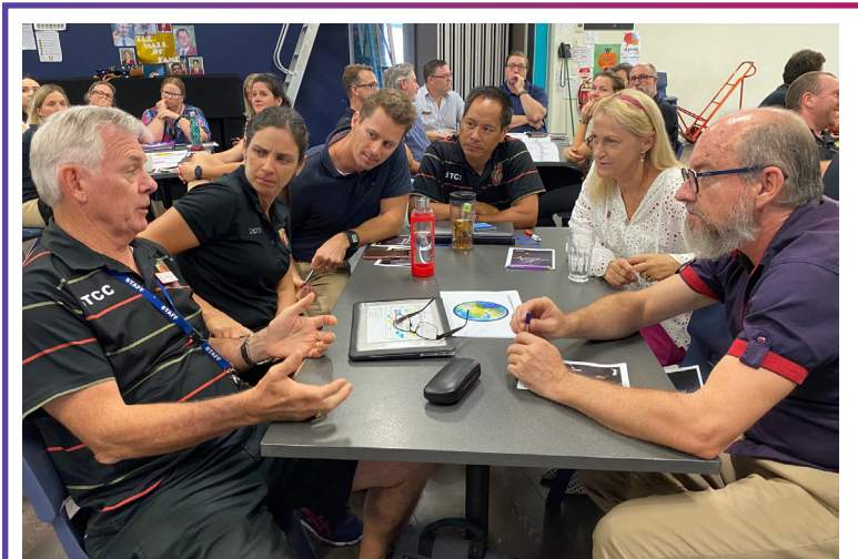
One Wild and Precious Life at St Teresa's Catholic College, Noosaville (12 March 2020)

making meaning in our lives. As faith communities we inherently turn to our language of mystery, suffering, hope, compassion, surrender and more, to help us cope with situations beyond our control. Hearing this familiar language in our prayers and reflections over the last few months has helped connect us to our faith and increase our spiritual resilience. It is our communal language of love for our brothers and sisters that sustains and encourages us and helps us to be sowers of hope for our young people.