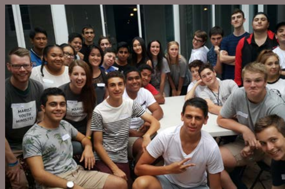
Connect group Eastwood