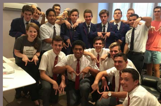
Connect group Randwick