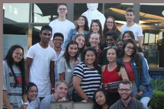
Connect group Macarthur