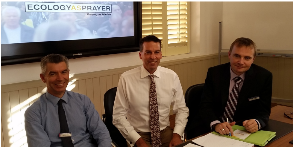
Our Daily Bread - Praying as Marists 13 May 2016