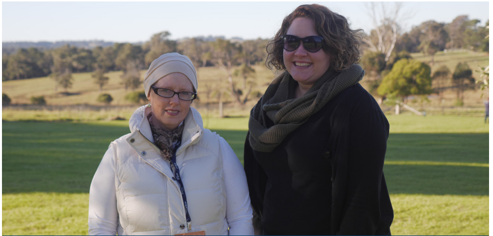
Footsteps 1 - Making Jesus Christ Known and Loved 1 - 4 May 2016

Mittagong once again hosted a Footsteps 1 Program from 1 - 4 May. Participants were privileged to experience not only a taste of gorgeous autumn weather in the Highlands but an opportunity to take a break away from their busy lives to spend time learning about our Founder. Through input and conversation Marists from around Australia gathered to share their own stories and reflect on how the spirituality Marcellin Champagnat influences their relationships with the young people in their care.