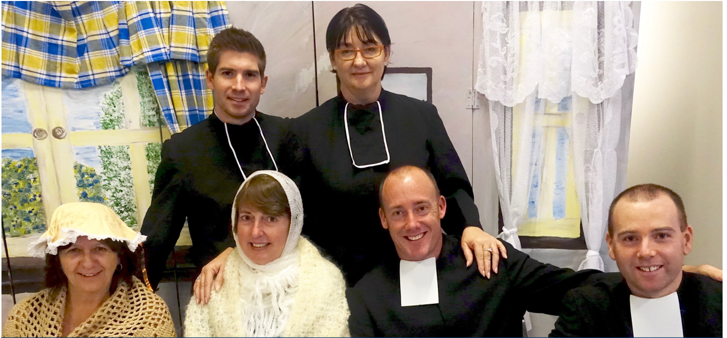
Footsteps 1 - Making Jesus Christ Known and Loved 1 - 4 May 2016