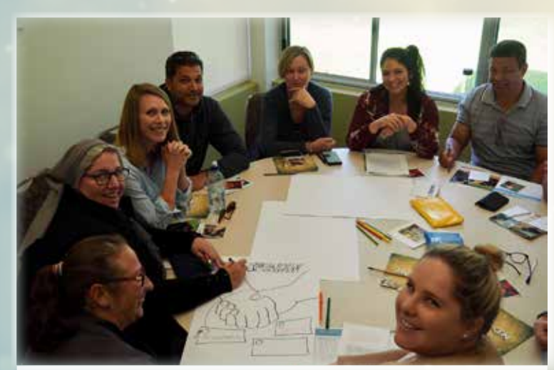
PARRAMATTA MARIST HIGH SCHOOL WESTMEAD 24 April 2017

The Awaken program focuses particularly on community and recognises how the Christian and Marist story influences our relationships. It enables participants to give witness to the way community is being lived out in our particular place and how it contributes to the enrichment of the lives of each other and our young people.