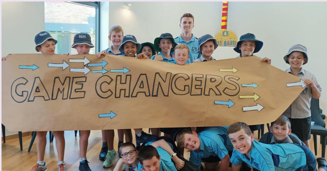
Game Changers students from Marist College, Canberra

At various school across Australia, Marist students have started their Game Changers journey this Term. From creating Rocky Road as a sign of creating authentic community to painting pots to represent the MSA theme of One Wild and Precious Life, with seeds being planted together with the goals of the students, hoping to see their goals blossom like flowers during 2020.