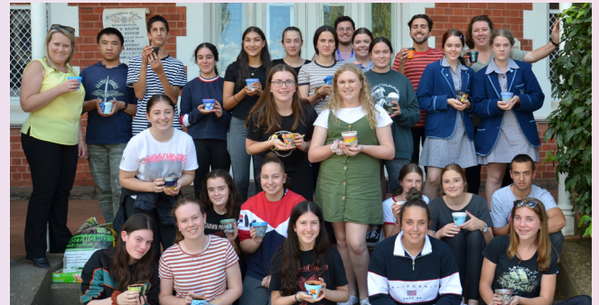
Game Changers students from Assumption College, Kilmore