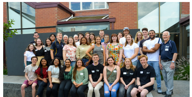
Young Marists in Melbourne (Various VIC School Graduates)

On behalf of all the MYM staff I would like to thank all school leadership teams and school staff for their support and encouragement. We are looking forward working more with you in the months ahead.