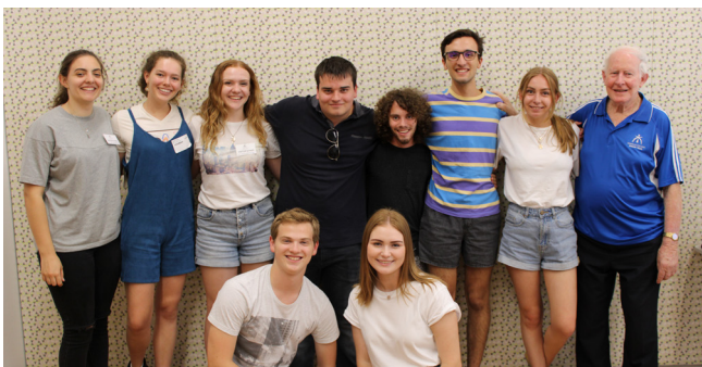
Young Marists in Perth (Newman College Graduates)

One of the great aspects of Marist Youth Ministry is providing opportunities for graduates from MSA schools to stay involved with different ministry opportunities around Australia. Besides the Immersion to the Philippines (December) and the Santa Teresa Holiday (January), plenty of local events are organised by MYM to connect, serve and grow . Like every year, we start our MYM year with a training day and launch, where we connect with the volunteers to inform and form them about these events. It was a great encouragement to see a large number of MSA graduates to attend our training days.