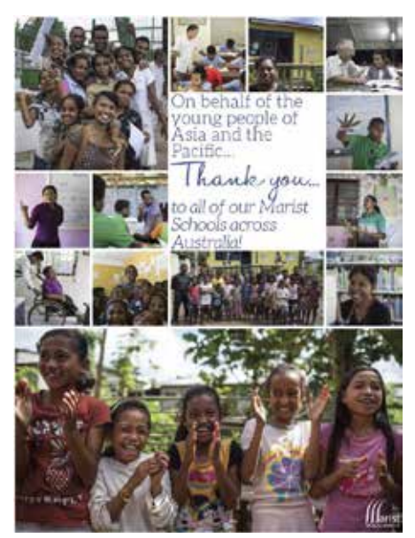
Children in Marist projects across Asia and the Pacific continue to build on their education because of your support!

As the year draws to a close our team at Marist Solidarity look back on a year that has brought great challenges and great change to the lives of children across Asia and the Pacific. This would not be possible without the support and imagination that drives Marist School communities across Australia to find new ways of valuing the youth of our neighbouring regions.