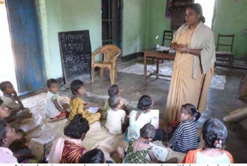
A teacher in a run down classroom speaks with her students

THE OPPORTUNITY... The Marist Brothers are urgently seeking a volunteer building supervisor, architect or engineer to assist with the construction of school facilities in Bangladesh. It is envisaged that the volunteer will stay in Bangladesh for a short period of time and provide an independent survey and consult with the local construction company. The follow up during the construction phases may then be facilitated online as the buildings progress.