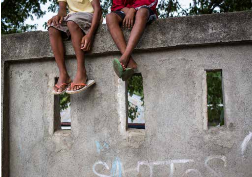
Two East Timorese children sit along the wall of the Cathedral in Baucau, Timor-Leste.