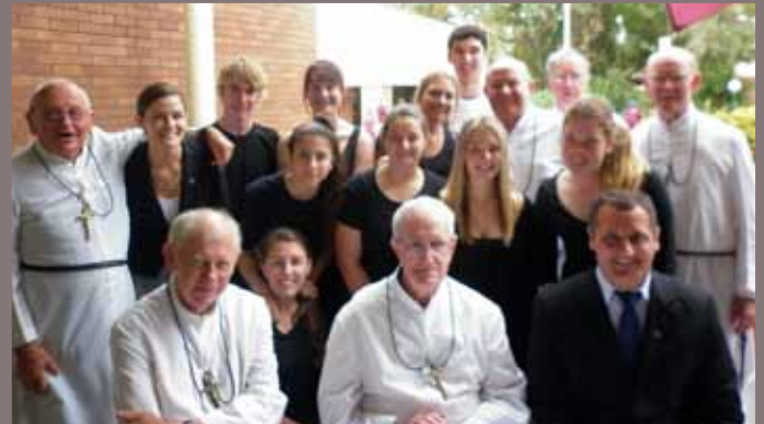
Pictured above: Brothers, staff and students after Mt Maria College, Enoggera's Champagnat Liturgy on 25 May

Trinity College Beenleigh celebrated a combined Trinity and Champagnat Mass in the school's Hall and followed up with a talent show that is obviously a hit each year with the students. Mt Maria Petrie's Mass was a much smaller affair but was moving and heartfelt and began with the screening of the hot off the press film released as part of the MLF Team's Champagnat Week Resources. Truly Champagnat has many faces!!