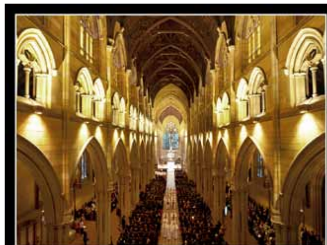
75th Anniversary of Marist College Eastwood St. Mary's Cathedral-Sunday 17th June 2012