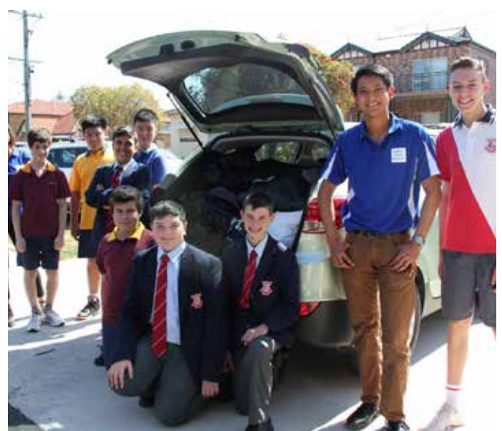
Marist College Kogarah students