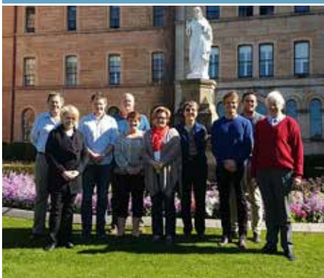
Marist Educational Leadership, Sydney 2017

Marist Centre Melbourne 5-6 & 26-27 May 2018