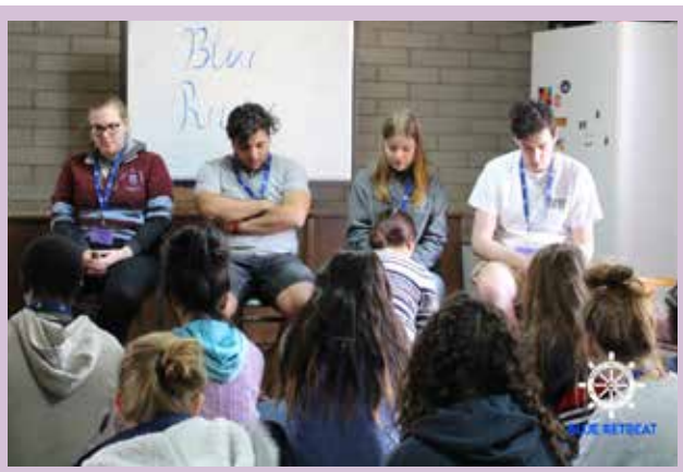
RMT in action at a Morning Prayer Session at the Blue Retreat in Alice Springs re-enacting of the Washing of the Feet with the Blue Rowers of Our Lady of the Sacred Heart Catholic College.