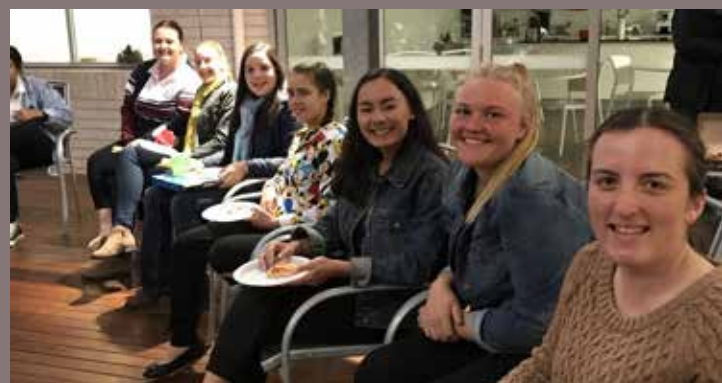
Students from Trinity College Beenleigh, Mt Maria College Mitchelton and Carmel College Thornlands enjoying dinner at our Term 3 Connect Night