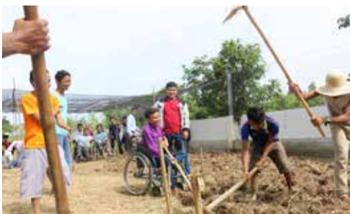
MSC Students and staff participating in the ground-breaking ceremony

More details are available on www.australianmaristsolidarity.org.au