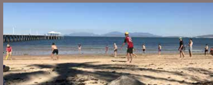
Burdekin Catholic High School students enjoying some beach cricket on their Year 12 Retreat