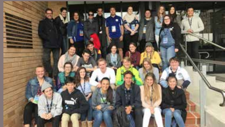
The Queensland group meeting together at Marist Youth Festival 2017