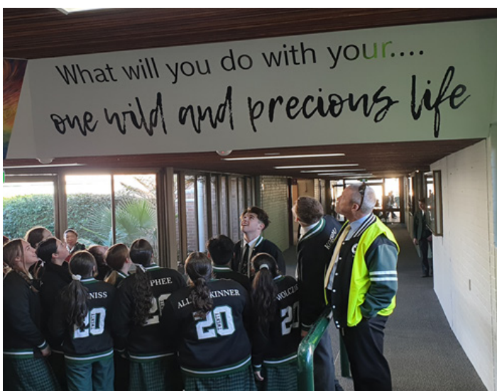
Students and teachers from John Therry Catholic High School, Rosemeadow pausing to reflect on their One Wild and Precious Life .