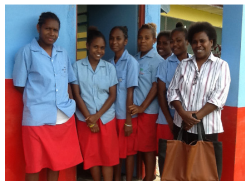
Students from St Michel Technical College in Vanuatu

Vanuatu: Lycée et Collège Technique St Michel, Santo.