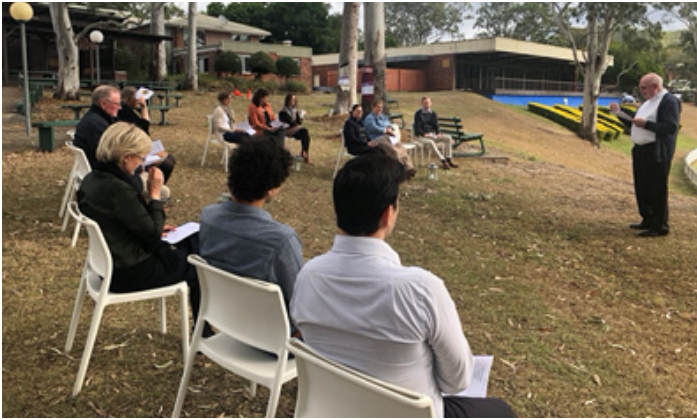
The Marist Centre Brisbane gathered under the gum trees with a liturgy celebrating the variety of Ministries working at the Centre.