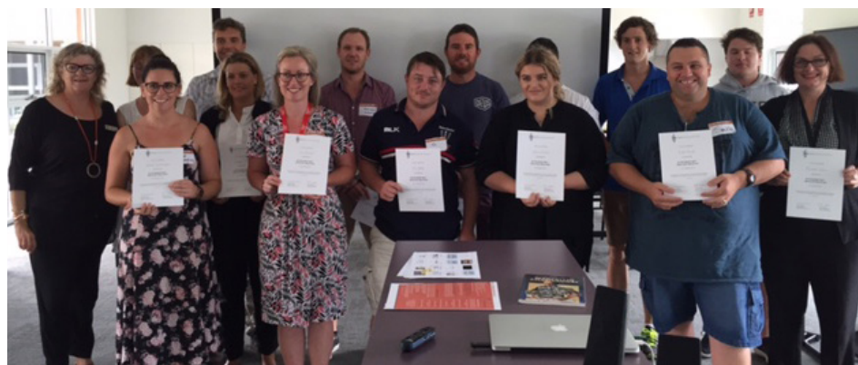
St Francis de Salles Regional College, Leeton, 27 January 2016