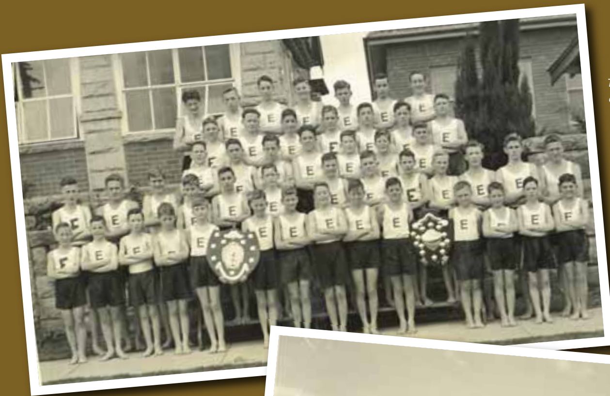
This photo has no details, but looks like an athletic team in the very early years of the schools' existence. The team is standing in front of the then Brothers' residence.