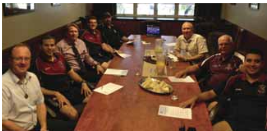
Marist Life Mentors workshop with staff at St Augustine's College, Cairns.