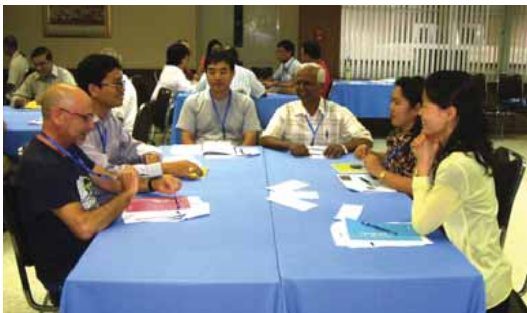
Marist Brothers and lay from across Asia gather around for a group session at the Funding and Proposal Workshop in Bangkok, Thailand.

project types, development cycles, project funding and project proposal writing. The knowledge gained will enable Brothers and Lay Marists to access the much needed funds to secure the future of their ministry.