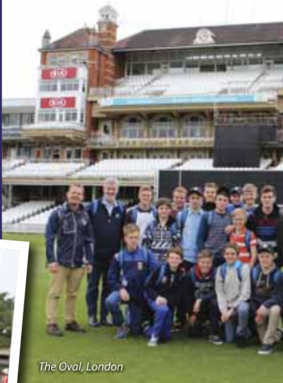
The Oval, London