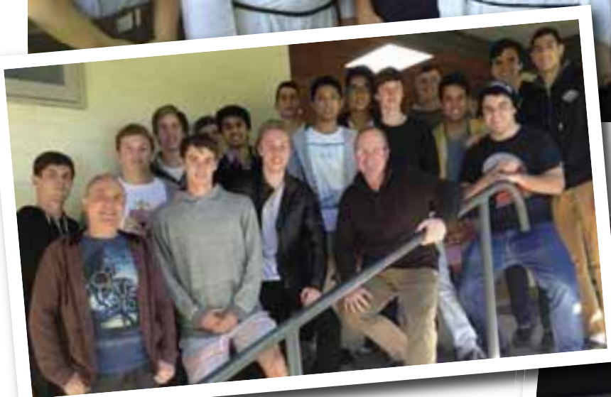
With Yr 12 Students from Marist College Eastwood