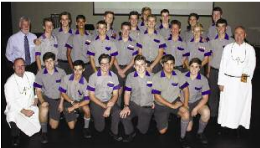
Year 12 Presentation at Marist College Ashgrove

This bold 'game plan' from our life coach and Chief Shepherd seems to hold three invitations: Firstly, for religious men and women to not just look back on the past with gratitude but to live the present with passion and embrace the future with hope; Secondly, for each of us to reflect on how we are called to be a disciple of Christ and find our vocation by walking a unique path of holiness; Thirdly, for young people to seriously consider taking up the invitation to a radical way of following Jesus in Religious Life; through prayer, community and service to people on the margins, especially the young.