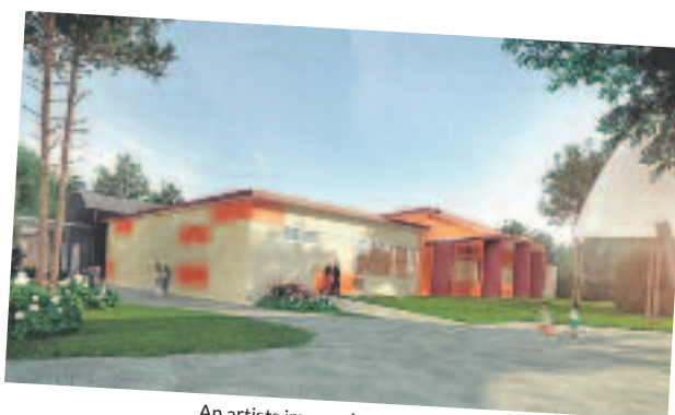
An artists impressions of the new Open Learning Building.