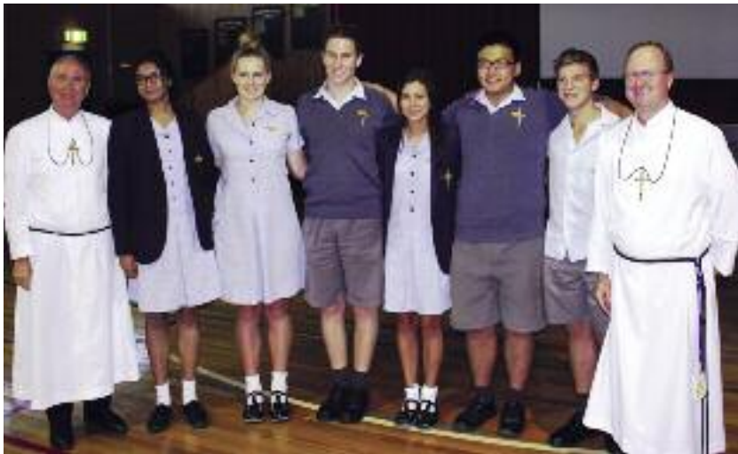
Year 12 Presentation at Lavalla Catholic College Traralgon