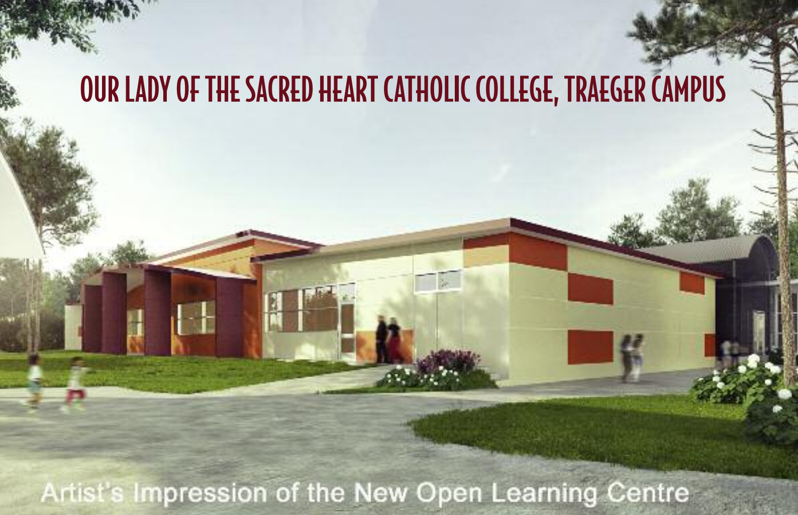
Artist's Impression of the New Open Learning Centre