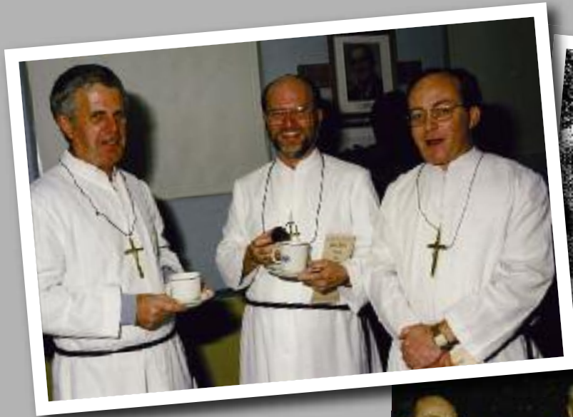
Brothers Community House