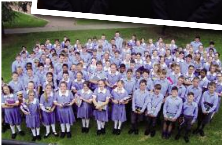
The 2015 class of Year 7's on their first day at Red Bend Catholic College.