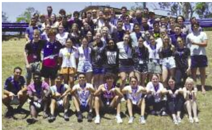
The group at the QLD Marist Student Leaders Gathering

2019 has kicked off with a bang in Queensland! We started the year with the annual Young Marist Volunteers' Camp. Ten ex-students from five Marist schools were in attendance. The 3-day camp involved training in practical ministry, child protection, faith formation, visits to Blind Eye Ministries and the Rosalie Brothers' Community and a lot of fun in the process!