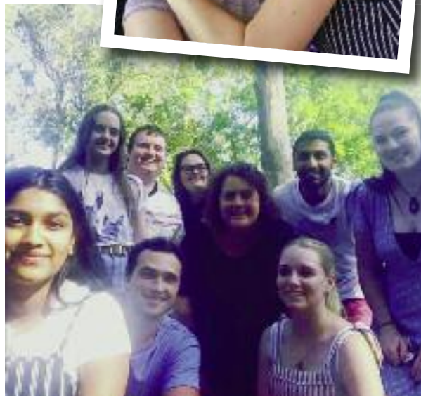
Ex-Students at the Marist Volunteers Weekend