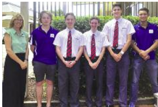
Student Leaders at Marist College Eastwood