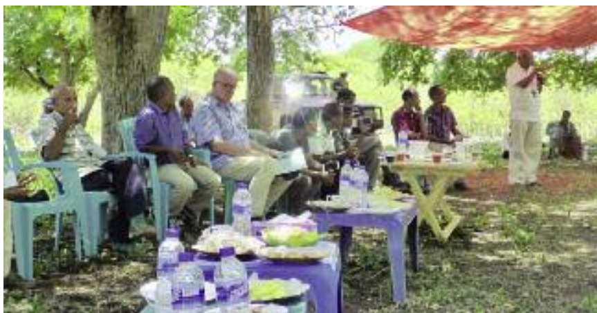
Bishop Basilio do Nascimento addressing the gathering

At the conclusion of the signing, there was a symbolic gesture of handing over the documents to the Brothers. The Bishop stated clearly to all present that