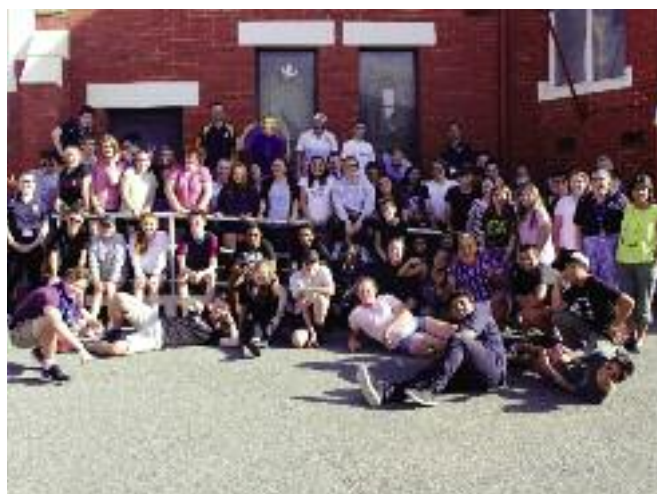
Red caravel Day at Notre Dame College Shepparton