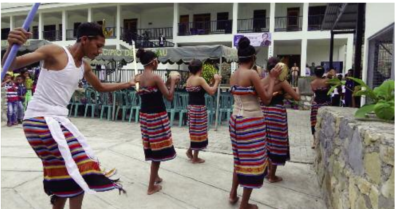
Guests are welcomed with a traditional dance.