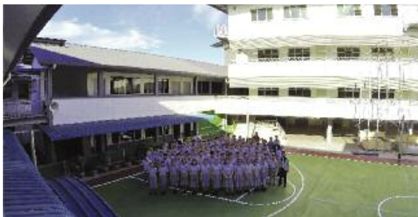
SJIS Last day of school