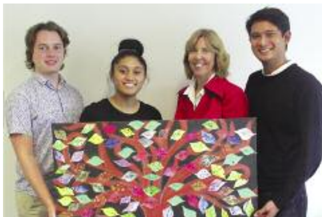
Marist Youth Ministry Sydney Team