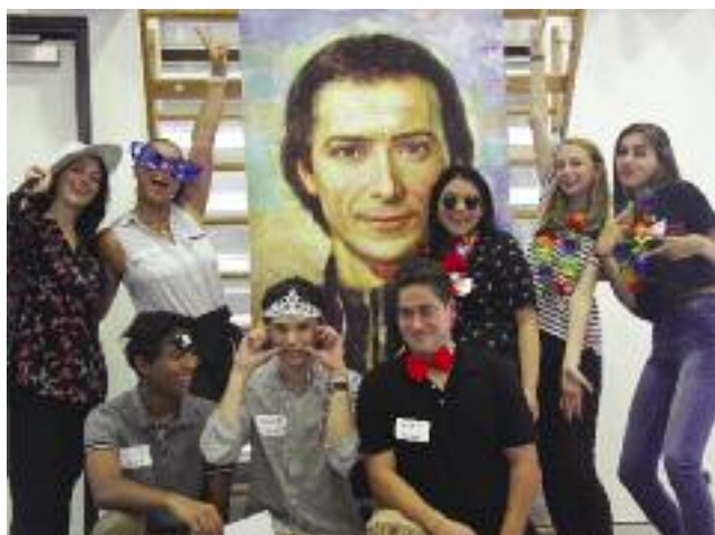
Student Group at Super Connect