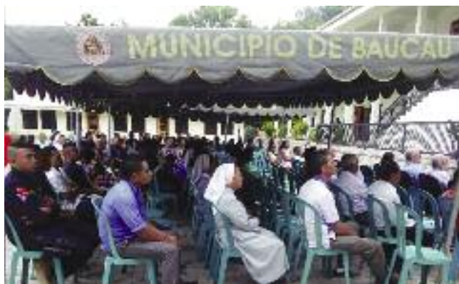
Part of the congregation