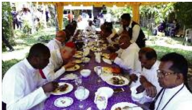
The Official Table for lunch.