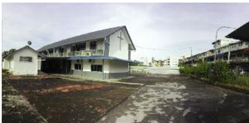
SJIS before construction

Note: The writer would like to thank the the Marist Brothers at Mascot, Drummoyne, Campbelltown and Rosalie for the warm hospitality, wonderful before and after dinner chats and superb meals during her visit and stay. It truly made her time in Sydney and Brisbane a memorable one.