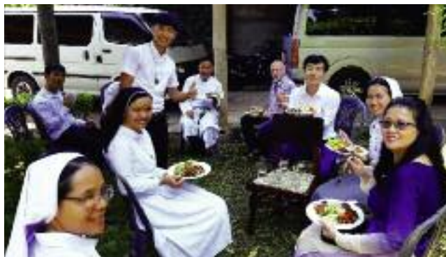
Some of our Vietnamese novices and friends.