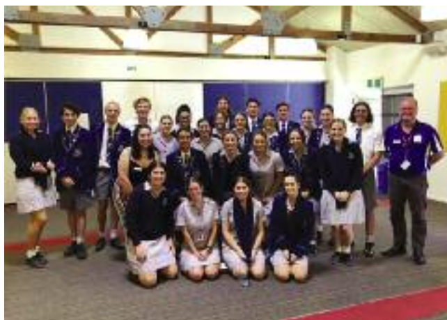
Visiting Student Leaders at Assumption College Kilmore