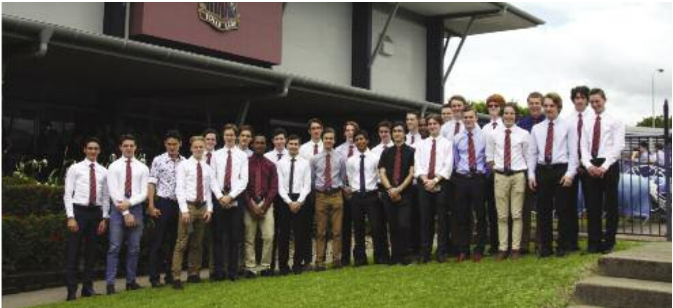
OP 1 – 5 Students Class of 2018

On 7 February 2019, St Augustine's College commended the school's academic high achievers at the first of its biannual academic awards assemblies. The primary focus of the assembly reflects its namesake - to award those students who achieved highly during last year's final semester.