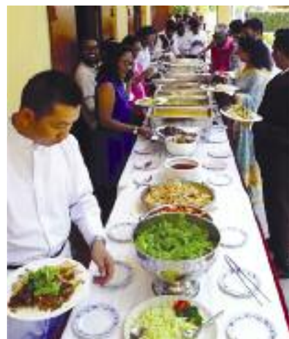
Enjoying the buffet lunch.