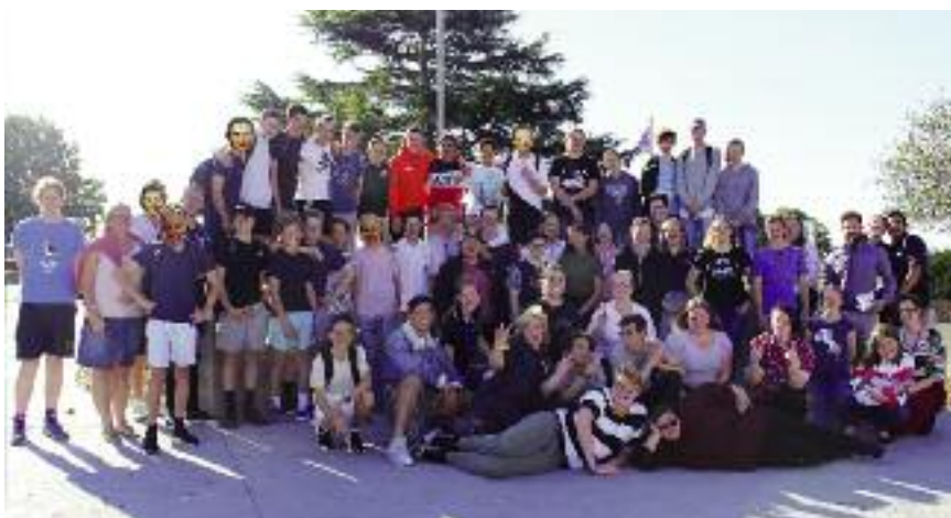
Red Caravel Day at Marist Sion College Warragul

"The Red Caravel Days have been an excellent start to my year of Mission. To see so many