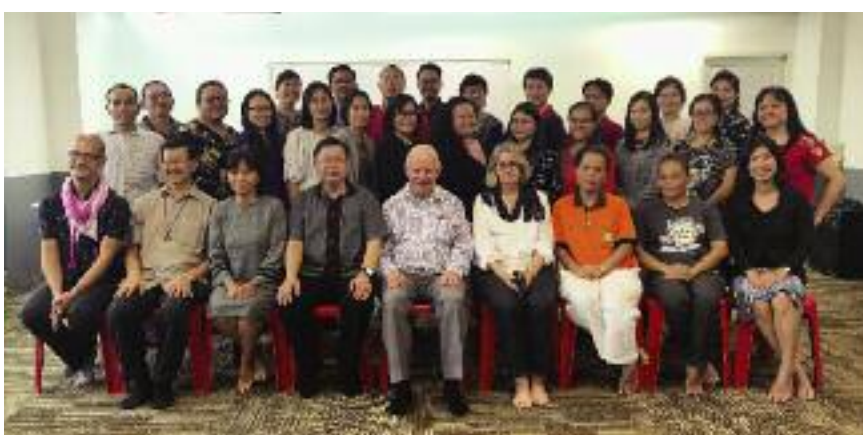
Staff of SJIS before school reopens

We are educating either tomorrow's problems or tomorrow's solutions. We have in our classes people who can make a significant difference to the lives of many. The great challenge is to mobilize action, rather than to allow the silent majority to do nothing."