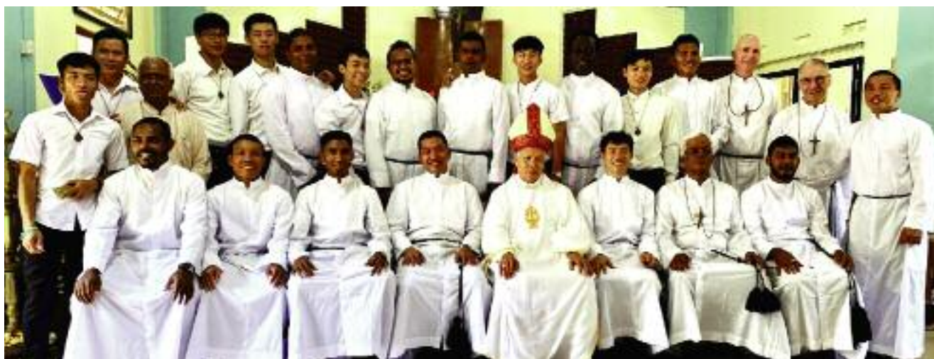
The whole community at Tudella – 1st Year Novices, Staff and newly professed Brothers, with the Archbishop.