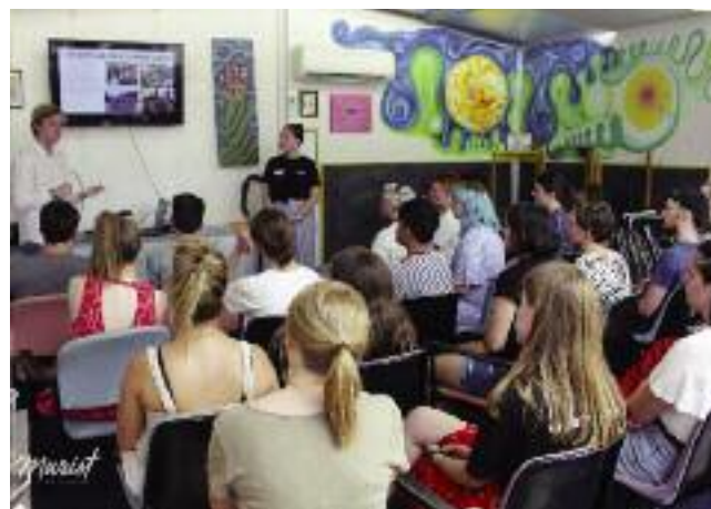
Volunteers Training Day at Heidelberg West