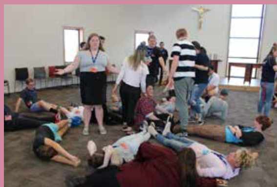
Red Rowers doing a group activity to illustrate we are all needed in our community.

The RMT members facilitated their first retreat of this season at Marist Sion College on Friday 15th March, with over 40 Rowers from three different schools (Lavalla Catholic College and Marcellin College, Bulleen). The Rowers were engaged in a variety of activities discussing global and local social justice issues and engaged in community building and leadership games during the day. The RMT will continue to travel around Victoria and fly to Sydney, Brisbane, Alice Springs and Perth to facilitate the other camps and retreats and they look forward meeting you and your students.