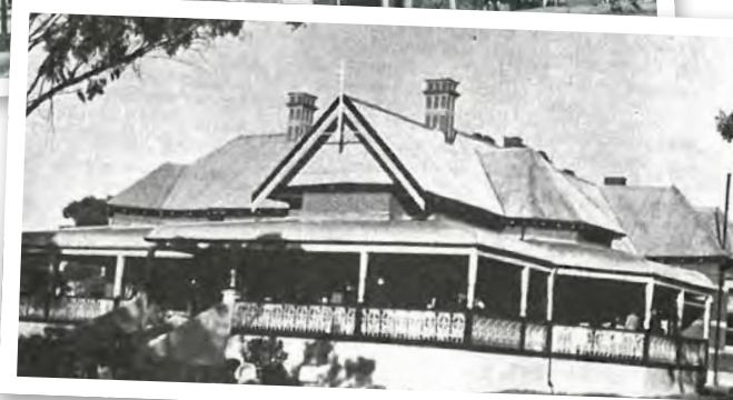
Top left: First building at St Francis Xavier's College, Bunbury. Top right: Early photo of St Joseph's College, Subiaco. Centre left: Students in St Ildephonsus College Chapel at New Norcia. Centre right: First building at Newman College, Churchlands. Bottom right: Fermoy House, original school of the Marist Brothers at Northam. Background (below): St Ildephonsus College, New Norcia.